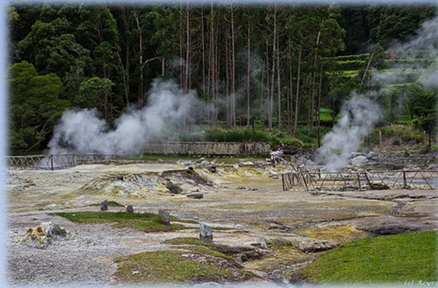
Fumaroles in São Miguel Island